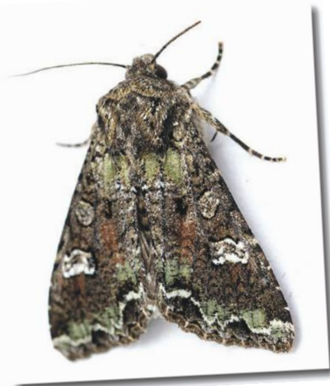
Bertha army worm