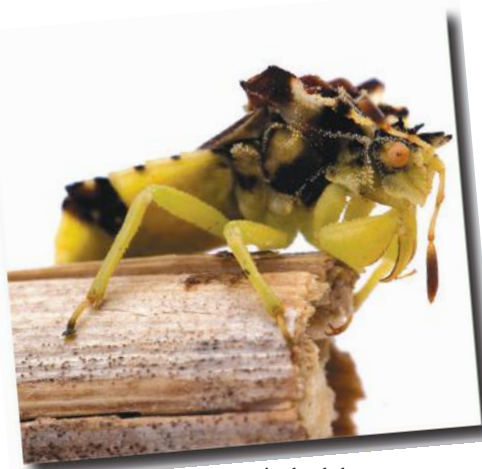
Ambush bug (a beneficial predator)